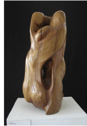
"FAMILY" Hand carved Cherry wood 17" x 7" x 9"