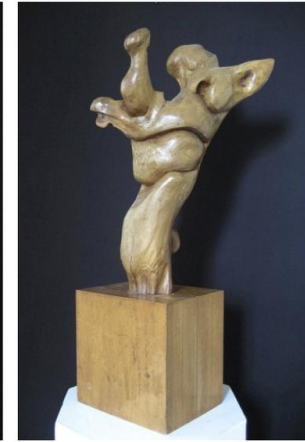
"MOTHER & CHILD" Hand carved Cherry wood, laminated wood base 17" x 10" x 10"