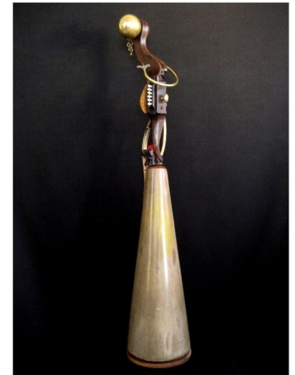
"MUSE" Found Object Assemblage 52" x 12" diameter

To take some found metal objects, a bunch of wire and a few dabs of paint and translate them into prize-winning sculptures takes not only manual dexterity, but an aesthetic vision. In her hands, like clay made into man, new objects can turn magically into 'beings'.